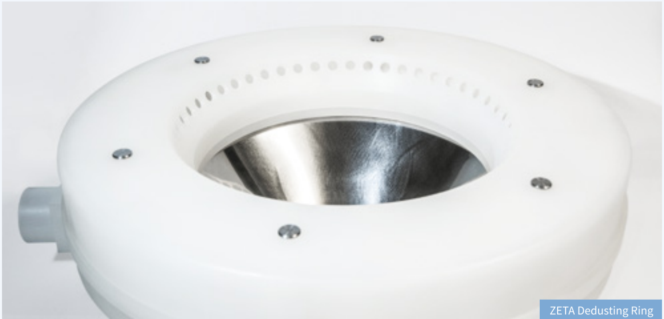
ZETA Dedusting Ring